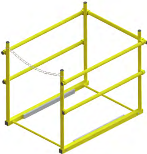
SHWC-3036 Safety Railing with Standard Chain