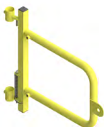
SHG-2436 Optional Steel Gate