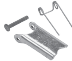
916-G LATCH KIT FOR CAMPBELL HOOK