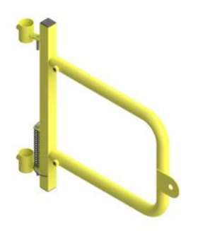
SHG-2436 OPTIONAL GATE—SEE SEPARATE SUBMITTAL FOR DETAILS