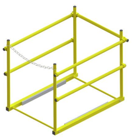
SHWC 3036 RAILING WITH STANDARD ZINC-PLATED CHAIN