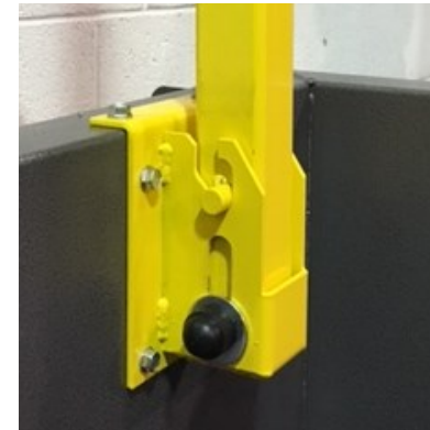
Post Installs to Roof Hatch Curb with 6 Self-tapping Screws